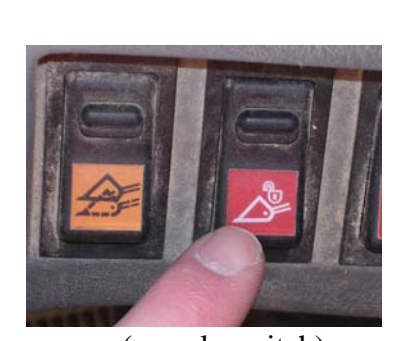
(sample switch) 5) SLOWLY RUN THROUGH LIFT.

Most wheel loaders have a locking switch in the cab. Move it to the proper position to engage pins.